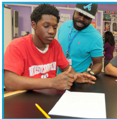
A program youth receives assistance during a group therapy session.